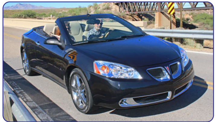
Joe & Kelly Findysz • 2008 G6