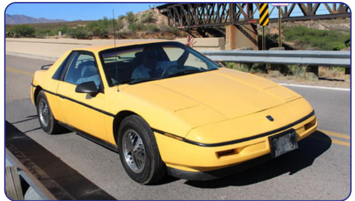
Dave Green • 1988 Fiero