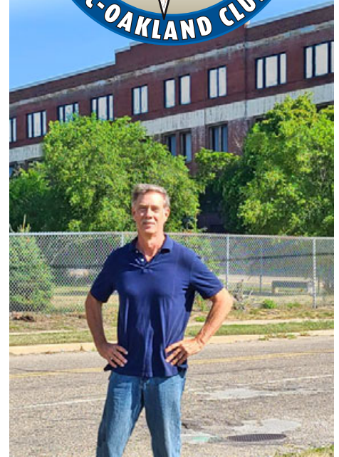
ABOVE: One of the activities at POCI's Centennial gathering will involve a bus tour of historically important sites around Pontiac, Michigan. Pictured above is PMD's very first Administration Building, located at 196 Oakland Avenue.

SHOWDOWN! Our chapter's recent Breakfast Cruise saw this handsome caravan of nine Pontiacs plus a single GMC Truck return to the Mescal Bar & Grill in the Old West community of Mescal, Arizona, a quick 25 miles southeast of Tucson. The drive took place on Sunday, May 17th, 2026.